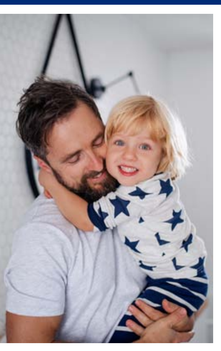
Our corporate team will support you once you start operating.